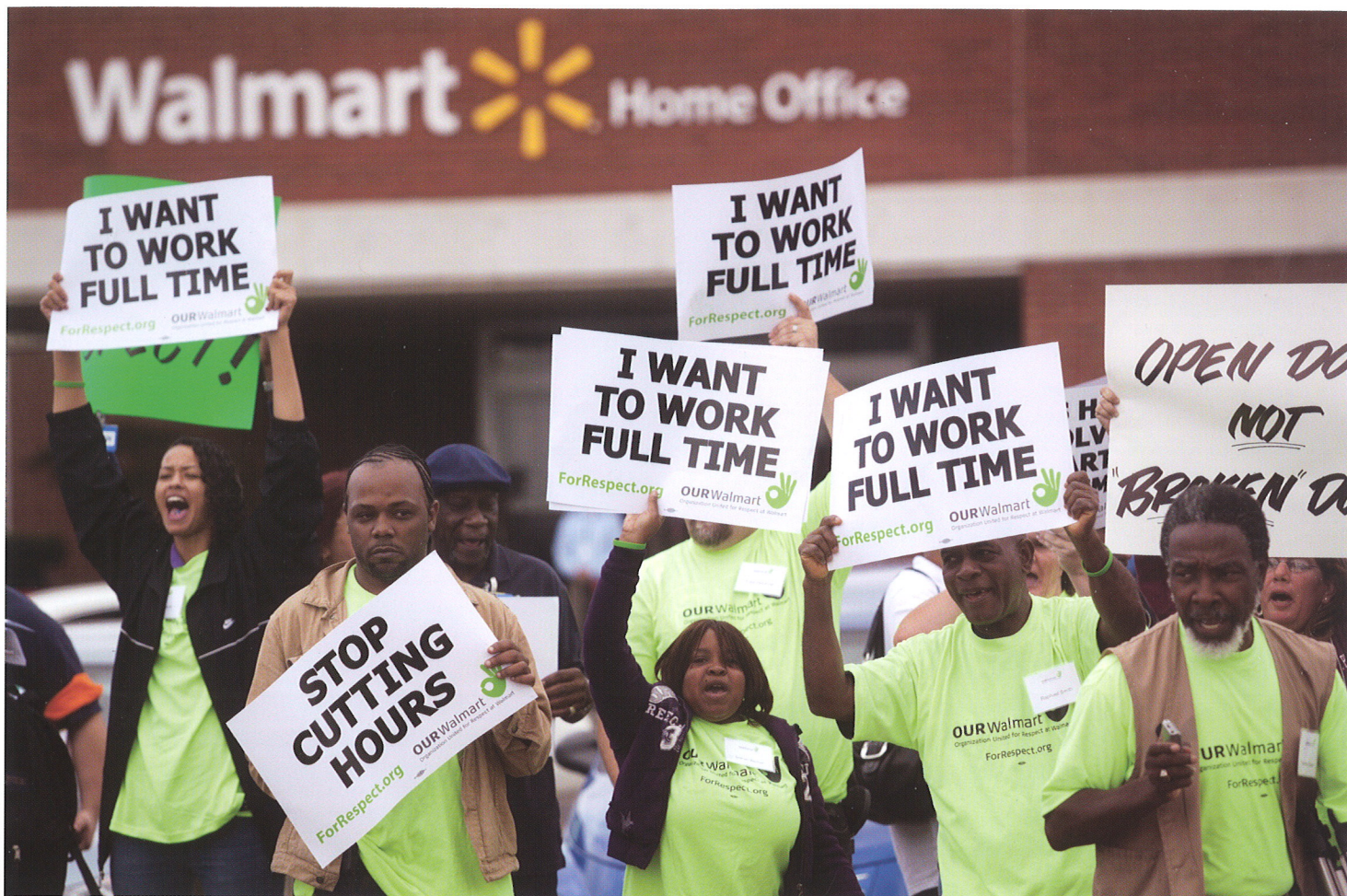
OUR Walmart demonstration, 2011.

support from the official labor movement. The United Food and Commercial Workers, for example, has provided ongoing support to OUR Walmart, a national drive to upgrade conditions at Walmart, where workers earn below-poverty-line wages and routinely turn to food stamps and other government aid. The Service Employees International Union has encouraged the efforts to organize fast-food workers. Construction unions, especially the Laborers' International Union of North America, have supported worker centers and other alliances among immigrant day laborers. The list goes on. These efforts are so widespread and so energetic that the AFL-CIO recently resolved to open its doors to such groups more widely, deciding at its 2013 convention in Los Angeles to affiliate community-based advocacy and membership organizations that share its basic aims and principles.