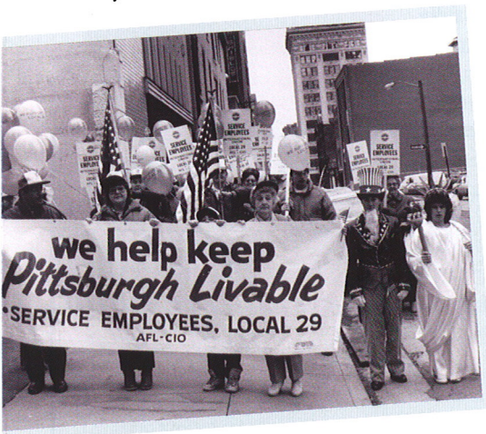
Members of AFSCME Local 29 in Pittsburgh protest against a lockout, 1985.

We believe this common story of obsolescence and decline is wrong—that it mistakes a small part of the labor movement for the whole and ends up writing an obituary for a movement that in fact is still very much alive.