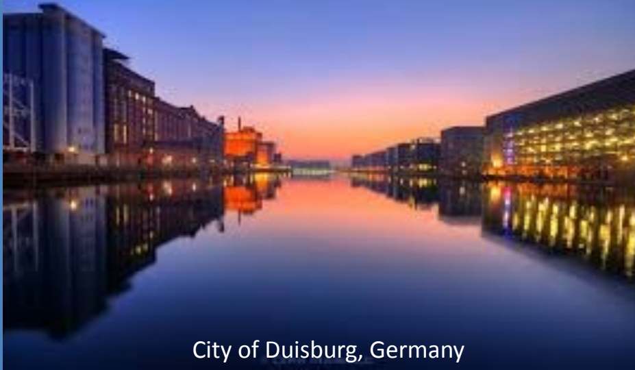
City of Duisburg, Germany