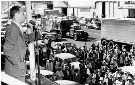
November 8th at the Philip J. Levin Theater, Rutgers University, New Brunswick