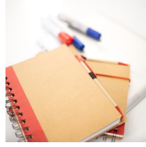
Your Course Syllabus