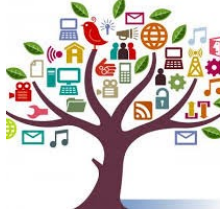
Information Literacy Update