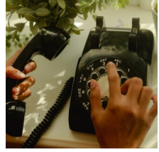
Call for Research Activity