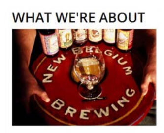
Culture isn't what you say, it's what you do