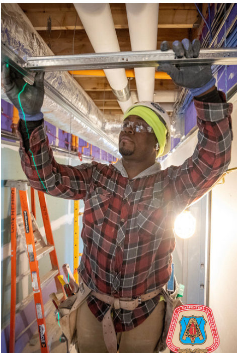
Eastern Atlantic States REGIONAL COUNCIL OF CARPENTERS

In my previous research , I have found some of the major drivers of rising inequality to be declining unionization; tax cuts for the super-rich; labor market deregulation; the replacement of full-time, permanent jobs with part-time and temporary work; a weak social safety net for working families; and the increased role of finance, insurance and real estate in the economy.